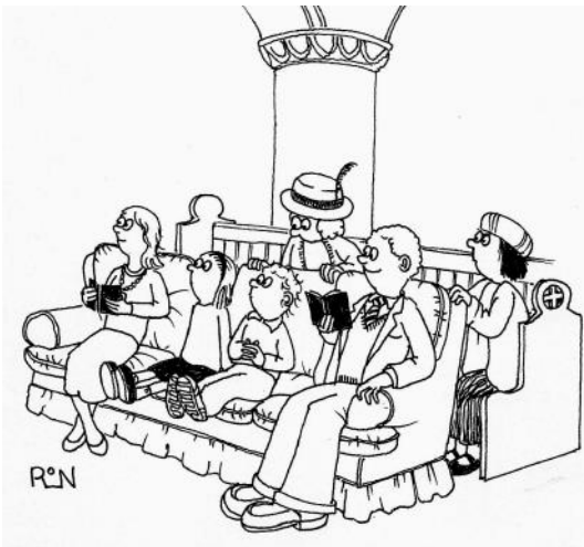
Regular worshippers were upgraded to first class